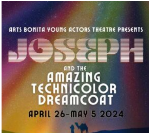
JOSEPH AND THE AMAZING TECHNICOLOR DREAMCOAT