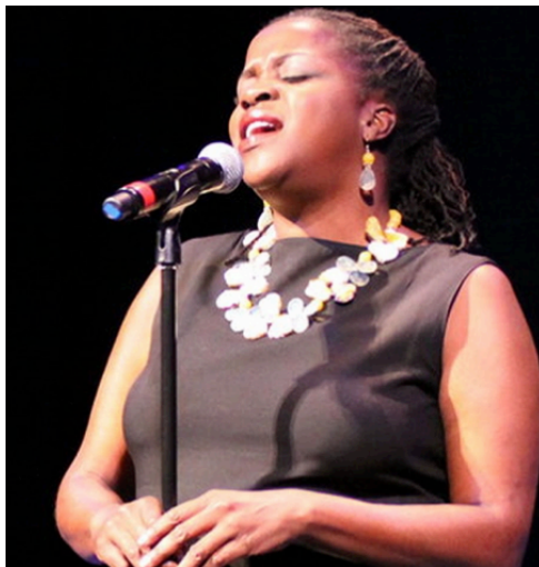
ALL THAT JAZZ